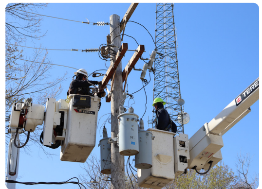
Line workers quickly dispatched to restore power