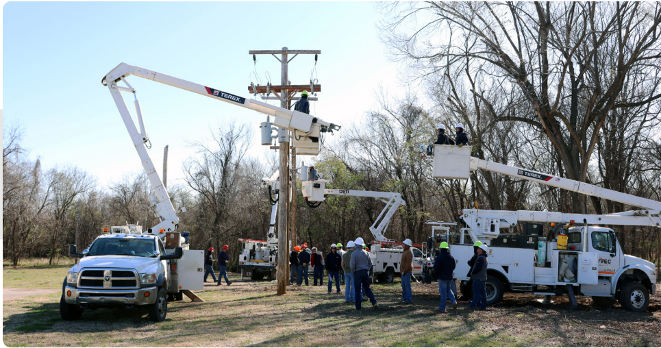
VVEC vehicles supported by UScellular's Fleet Solution